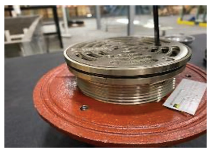
Remove the 5-1 strainer (keep the screws.)